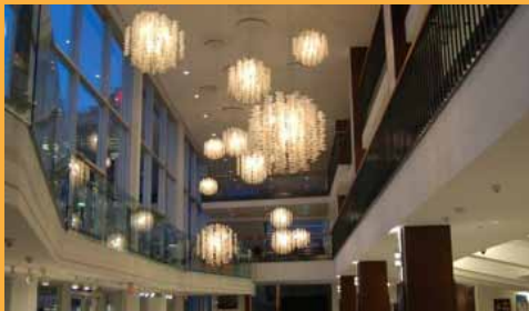
Eos Lightmedia's addition to the recent renovations at Vancouver's Queen Elizabeth Theatre

For more information check out http://oe.nrcan.gc.ca , or call the InfoServices Line toll-free at 1-877-360-5500.